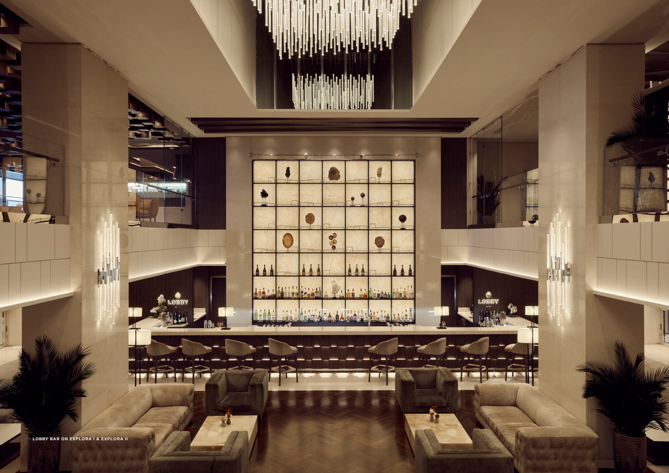
LOBBY BAR ON EXPLORA I & EXPLORA II