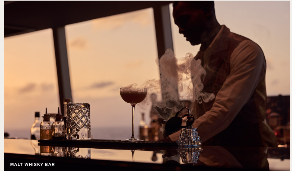
MALT WHISKY BAR