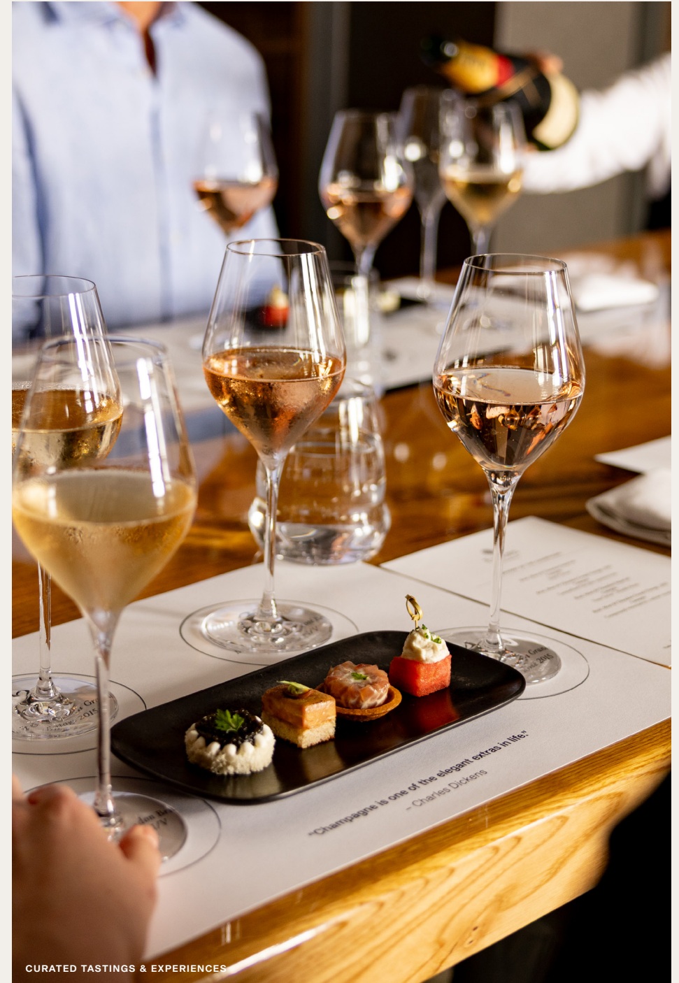
CURATED TASTINGS & EXPERIENCES